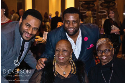
Jerome Bettis and his family enjoying Triple Indulgence.