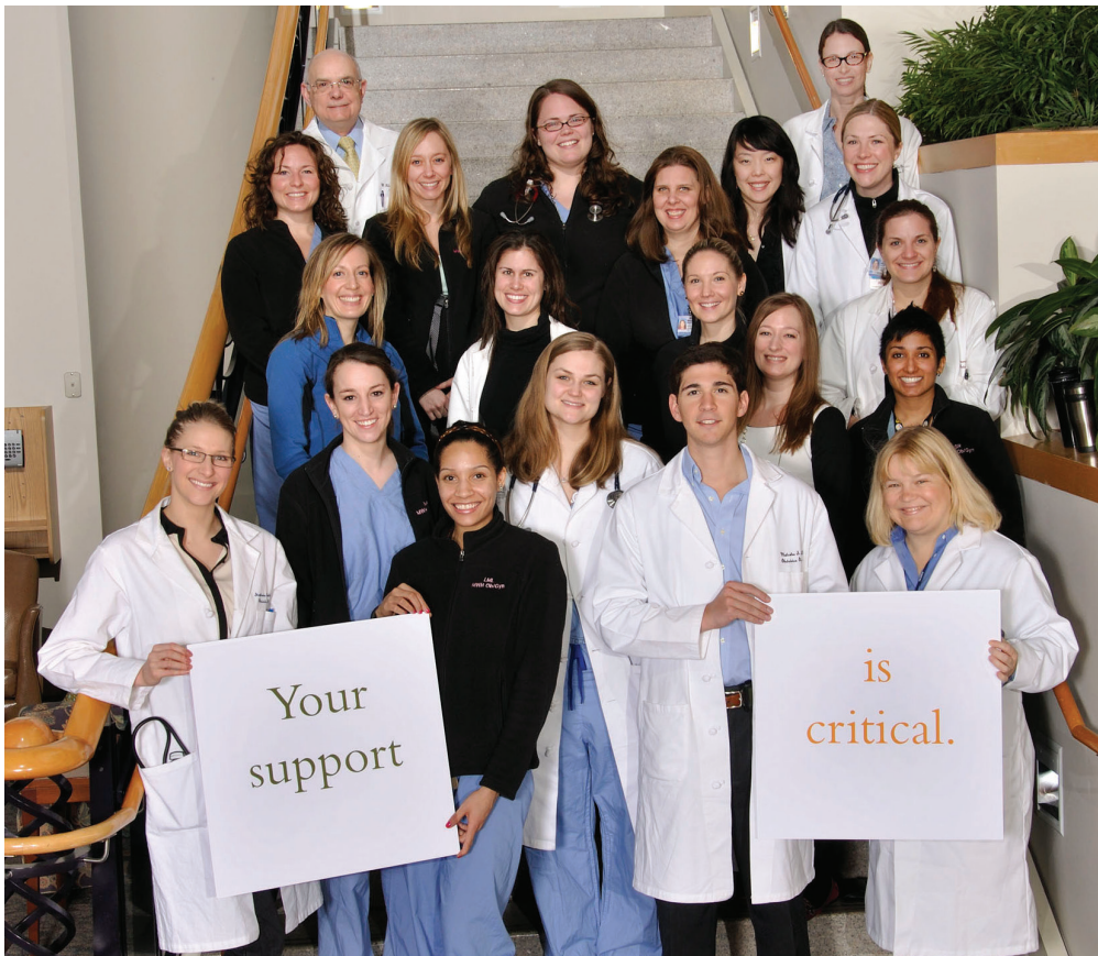
Congratulations to the resident class of 2013.