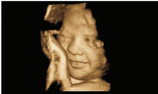
Smiling fetus at 33 weeks.

Improving patient satisfaction with their ultrasound experience has been a major goal for the division over the past two years. Despite our increasing volumes, we have managed to markedly improve the percent of patients whose exam is started within 30 minutes of the patient's arrival in the department.